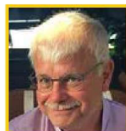
Piotr Robouch EU